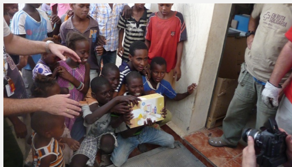
Aid is delivered to where it's needed

Because Disfrimur already worked with the charity, this provided a ready-made destination for donations. The company participated in the delivery of aid on previous occasions and drivers and support staff were already familiar with the work of the charity in Mauritania. This familiarity contributed to the success of the initiative.