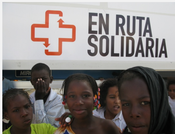
En Ruta Solidaria provides valuable aid to children in Mauritania