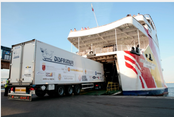
Disfrimur participated in the transport of aid